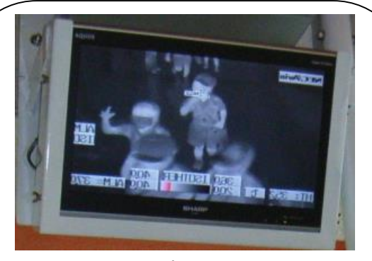
Heated area over 37℃ is displayed in red color . Alarm sound is generated simultaneously.

Also, the preschool started to use thermography to find heat stroke in summer. Temperature of toddlers, who are likely to be suffered from heat stroke, are increased. Those toddlers will be given water, and will take break.