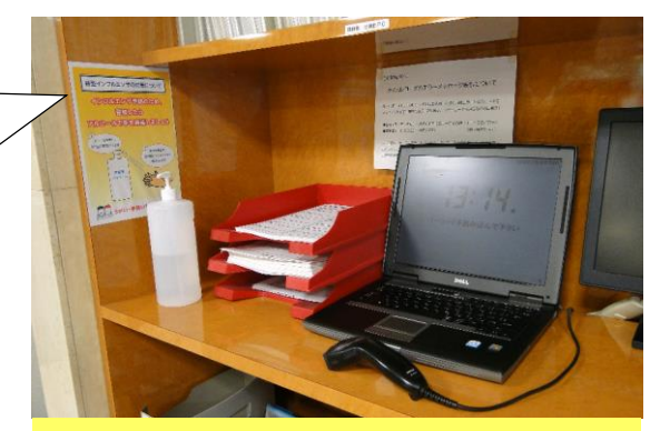
Teachers execute hand disinfection by an alcohol placed by the side of PC by which they register their attendance.