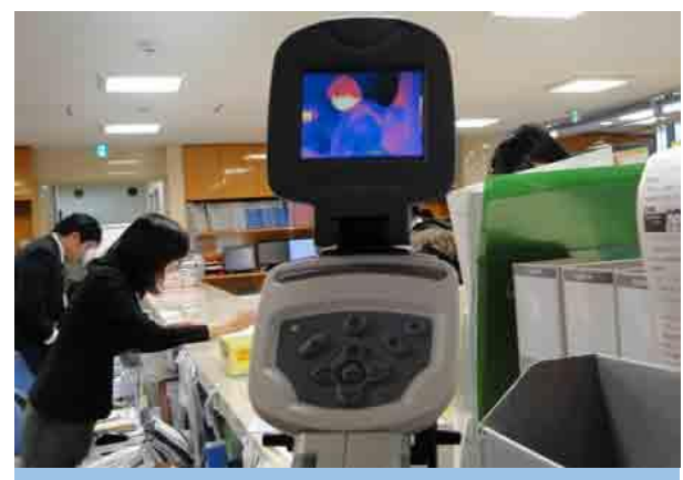
Measuring surface temperature of a student.